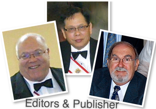
Editors &amp; Publisher