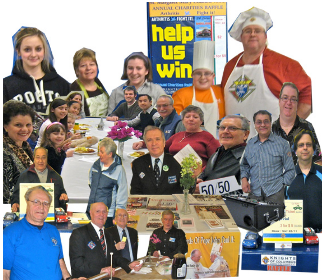
Pancake Breakfast March 6th